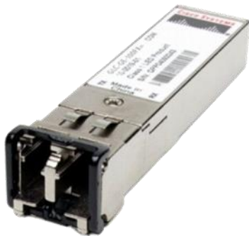
Figure 1. Cisco 100M Ethernet SFP