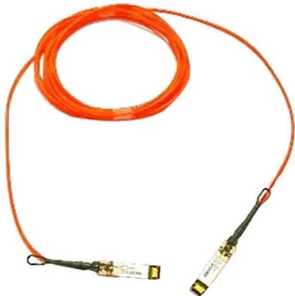
Figure 5. Cisco direct-attach active optical cables with SFP+ connectors

Cisco SFP+ Active Optical Cables (Figure 5) are direct-attach fiber assemblies with SFP+ connectors. They are suitable for very short distances and offer a cost-effective way to connect within racks and across adjacent racks. Cisco offers Active Optical Cables in lengths of 1, 2, 3, 5, 7, and 10 meters.