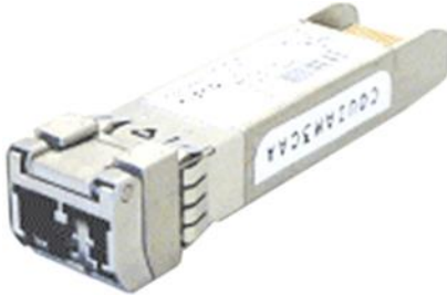
Figure 1. Cisco 10GBASE SFP+ modules

The Cisco® 10GBASE SFP+ modules (Figure 1) give you a wide variety of 10 Gigabit Ethernet connectivity options for data center, enterprise wiring closet, and service provider transport applications.