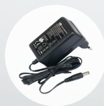
24V 0.8A Adapter