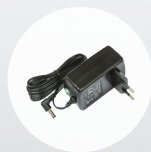
24V 1.2A Adapter