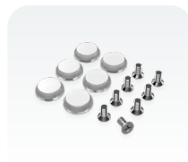
• Fastening set