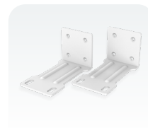
• Rack ears