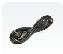
• 2 Power cords