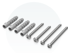
K-66 fastening set