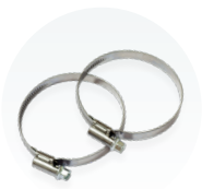
2x hose clamps