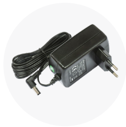
24V 1.2A Power adapter