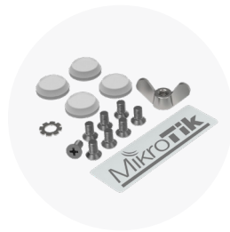
K-19 fastening set