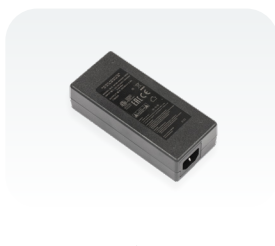
48 V 2 A power adapter