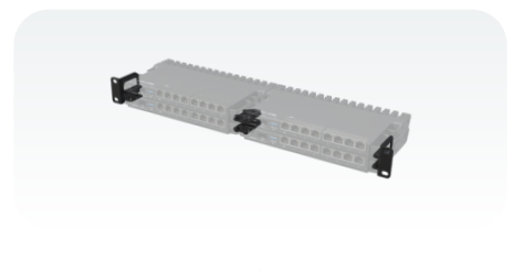
Rackmount kit K-79